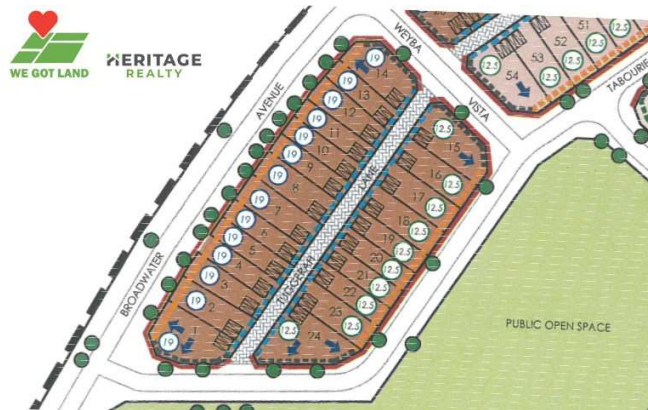
Stage 3B LDP – garages in the rear of lot